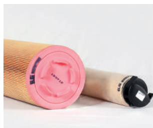
Heavy Duty Filtration for Demanding Conditions