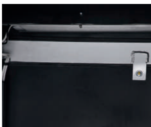
Optimised Cooling System for 122°F High Ambient Temperature