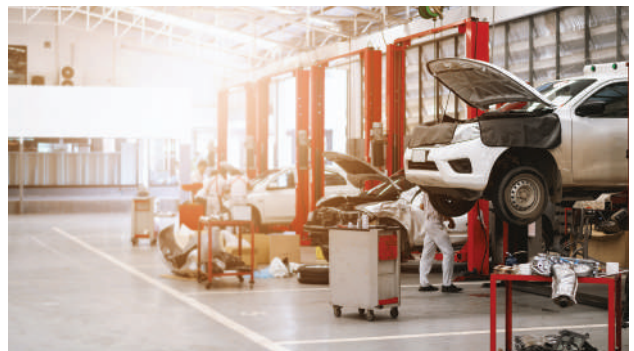
Vehicle Service Station