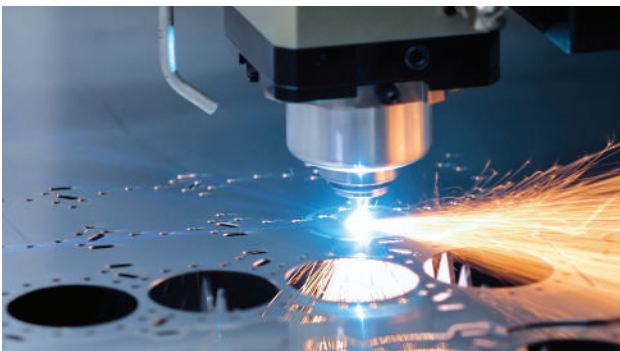
Metal Working and Laser Cutting