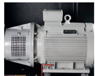
Reliable and Efficient TEFC Motors for Severe Duty Industrial Applications