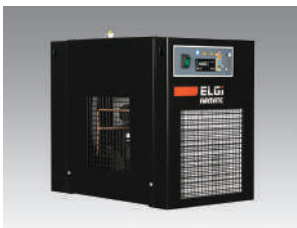
Compressed Air Dryer

Genuine service and regular service helps avoid unexpected compressor failures and the risk of subsequent damage to other vital compressor components. ELGi spare parts are designed, manufactured, and checked for quality to meet the standards of a new ELGi compressor. ELGi consistently focuses on improving spare parts to provide customers with the best results.