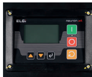
Easy to use Neuron XT Controller