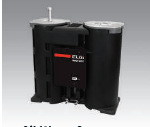
Oil Water Separator