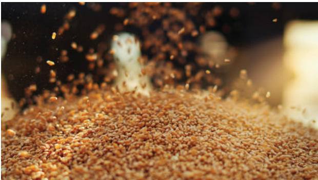
Sorting and Peeling